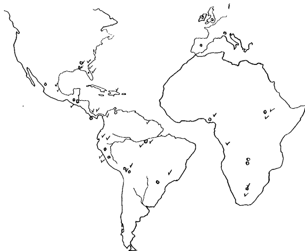
Florida anthropology students [v] and faculty [o] have studied and worked in fifteen countries and three states in the last three years. The map illustrates this range of interest as reflected in our programs. Represented are the countries of Mexico, Guatemala, Costa Rica, Colombia, Ecuador, Peru, Bolivia, Brazil, Surinam, Dominican Republic, Nigeria, Kenya, South Africa, Zaire and Zambia, in the United States, work is undertaken in Florida (8 counties), Georgia and South Carolina.