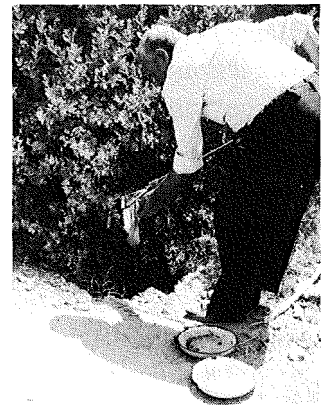
Field Worker Checks Possible Breeding Sites for Mosquitoes

yellow fever, bancroftian filariasis, and Rift valley fever virus, the snails that carry schistosomiasis,