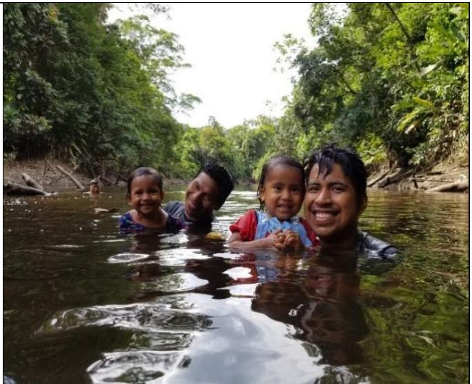
Cofán fathers swimming with daughters in Ecuadorian Amazon. 2018