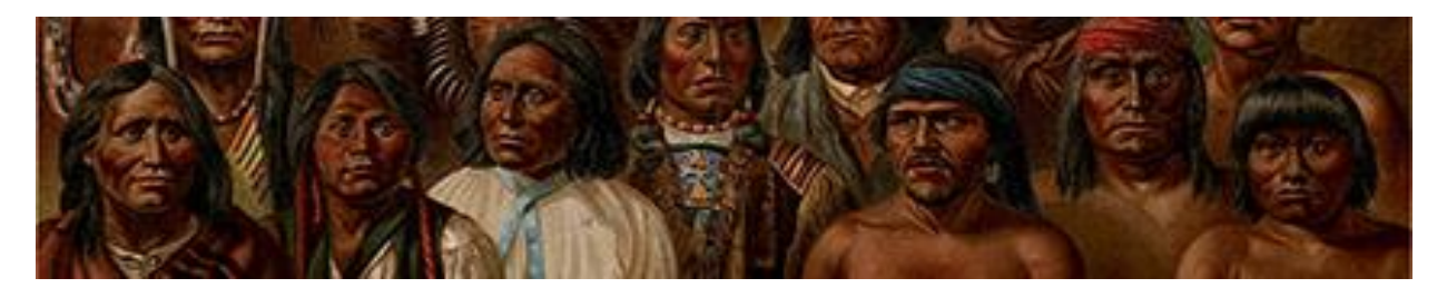
Week 6 (February 12-16): Indigenous Knowledge and Innovation in the Amazon