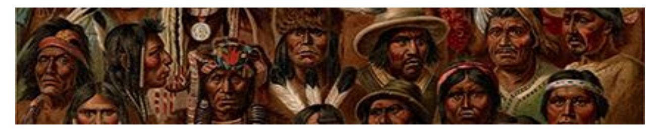
Week 4 (January 29-February 2): The Lowland Maya: Three Thousand Years of Human-Environment Interactions