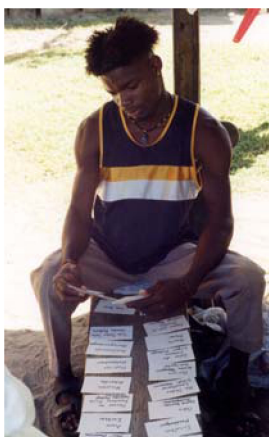
A young Honduran cmmnet.es a nilp sort

"El sida es sinonimo de muerte/" This phrase, "AIDS is a synonym for death," was the first free list response emerging in a brief focused ethnographic study on views of the disease in a Garifuna community along the Honduran coast. I was invited to conduct a qualitative study as part of efforts to inform an educational intervention by Honduran colleagues, and spent a couple of weeks in February